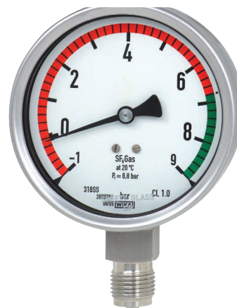
Gas density indicator model GDI-100