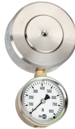
Hydraulic compression force transducer, model F1115

The force is measured using the principle of hydraulics: The force acting on a piston leads to a pressure increase that can be visualised on a connected display instrument. The scale of the display instrument can be defined in various units (e.g. N, kN, kg, t).